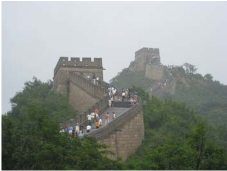
The Great Wall at Badaling