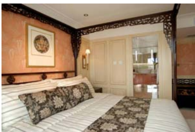
Celestial Suite & Imperial Suite