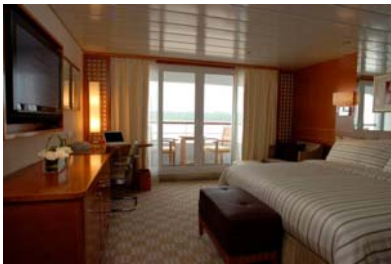
Jade Suite & Mandarin Suite