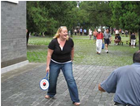
Trying my hand at Ball Tai-Chi!