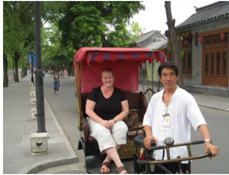
Hutong Tour via Rickshaw