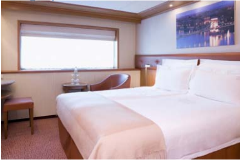
Approximately 151 sq ft