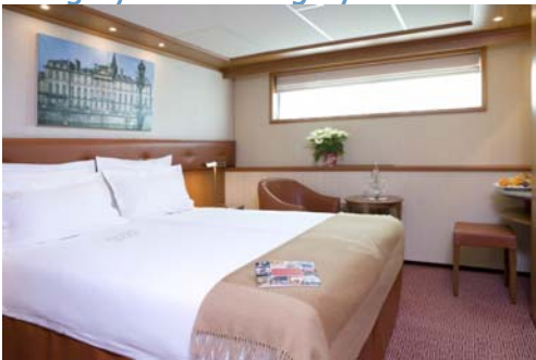
Approximately 151 sq ft